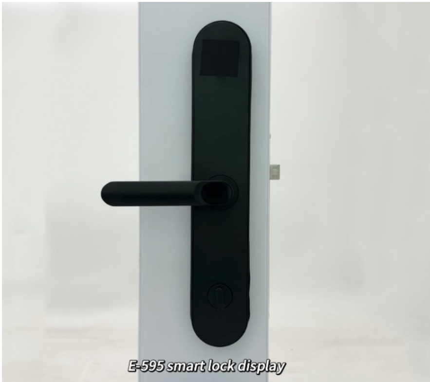
E-595 smart lock display