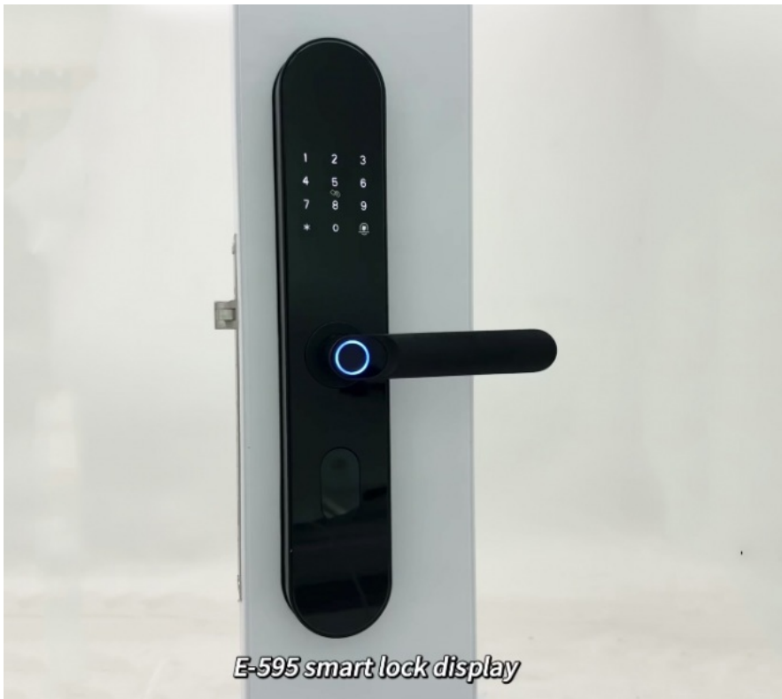
E-595 smart lock display