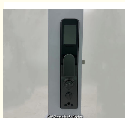
E20 Smart lock display