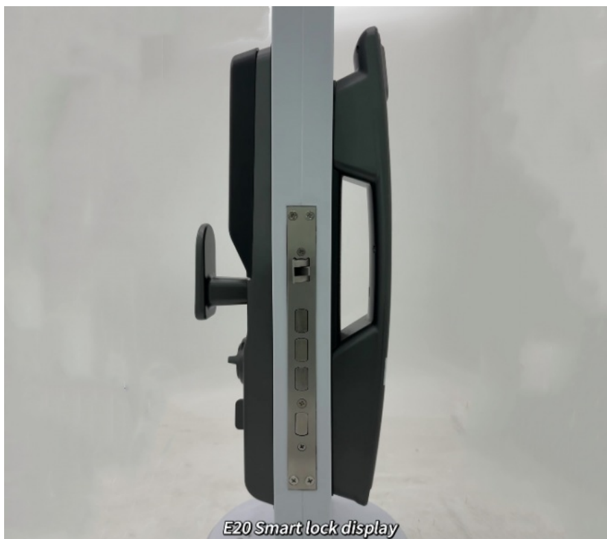
E20 Smart lock display

ELA 茵朗 Dongguan Yinlang Electronic Technolog Co.,Ltd