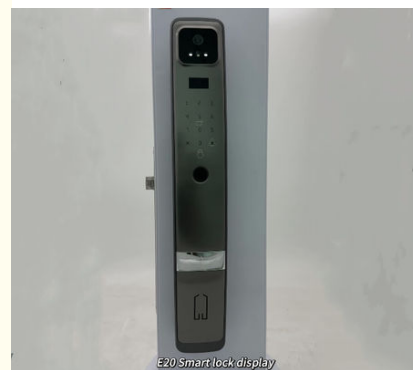
E20 Smart lock display