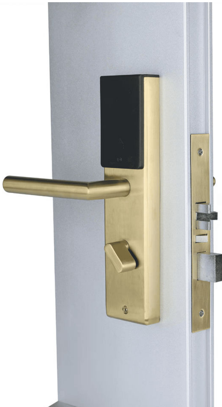
Adaptable lock body