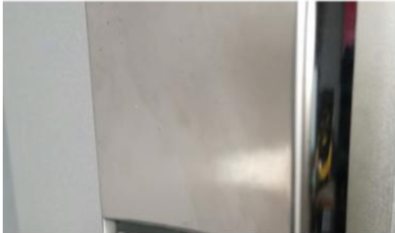
201 stainless steel panel