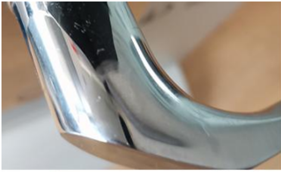
Zinc alloy handle