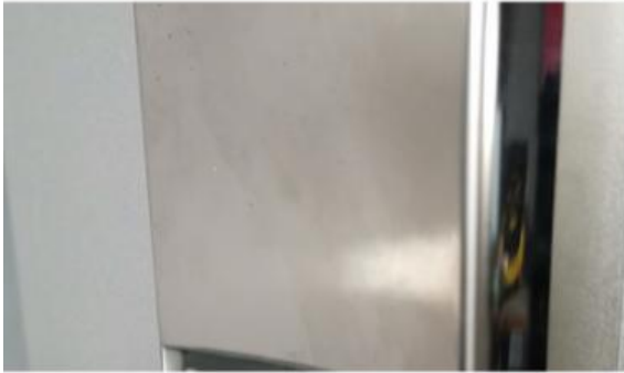
201 stainless steel panel