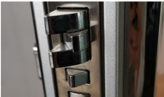
American standard lock body