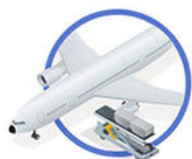
Air Freight Transport