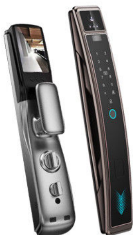
back panel front panel